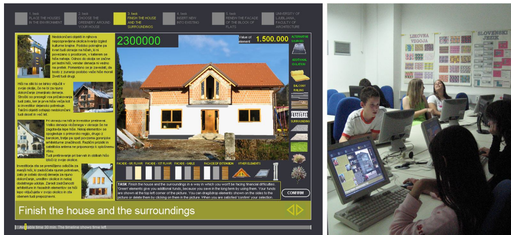
Fig. 1. Eco-spatial Education Interface (task no.3 and classroom setting)

The interface was designed as a collection of five selected tasks - each presented within one screen size. The screen was divided into several parts: two larger parts were dedicated to education, passing of information and task at hand, the bottom part of the screen was reserved for the title, the top for navigation. The contents of educational part (light-green) – texts and small pictures for reference were visible most of the time, while other multimedia presentations opened on the same page (either automatically or on demand, depending on the variation of interface) and played in bigger quadrant to the right. The same quadrant was also used for presentation of the task solving instructions and tests themselves (Fig. 1).