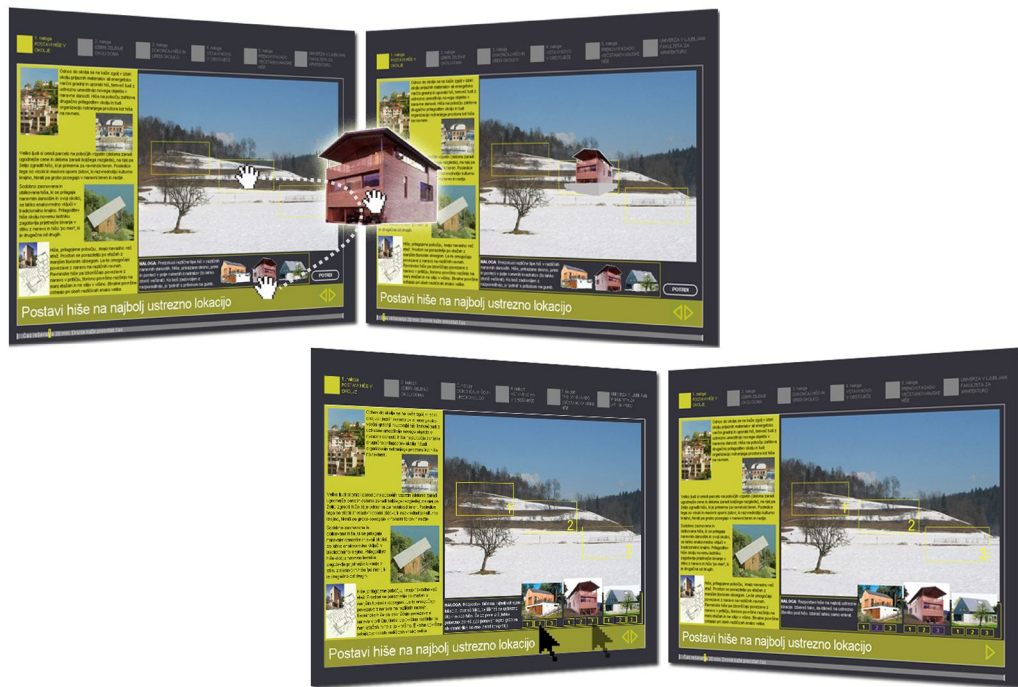
Fig. 2. Eco-spatial Education Interface: functionality, feedback (task no.1, maximum & minimum interactivity)

The animation (Video 1) presents the functionality and feel of Eco-spatial Education Interface – the most interactive version*.